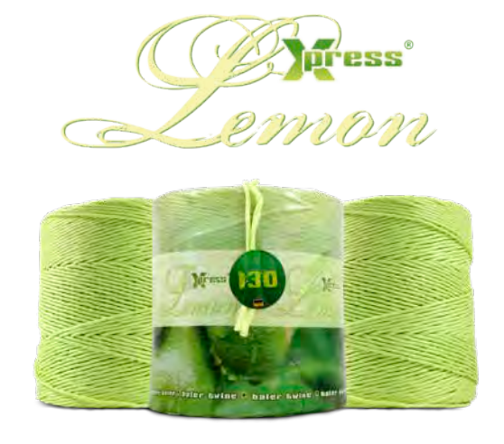
Refreshingly different, decisively better